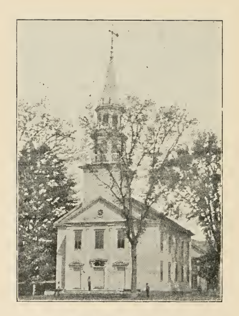
CONGREGATIONAL CHURCH, SOUTH BRITAIN.